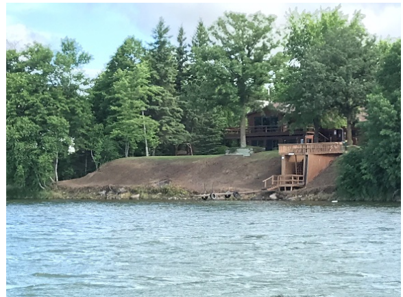
Intensive vegetation clearing is the removal of all or a majority of the trees or shrubs in a contiguous patch, strip, row, or block.

The purpose of the permit is to help property owners remove and restore vegetation in a manner that sustains natural character and animal habitat, and stabilizes slopes.