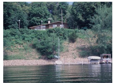
3. Steep slopes and bluffs visible from the river with no natural vegetation, degraded vegetation, or planted with turf grass.

If any of these restoration priority areas exist, then they will be the focus of the restoration plan. If none of these areas exist, applicants must propose other opportunity areas that could benefit from restoration. For ideas of other areas to restore, consult local zoning staff.