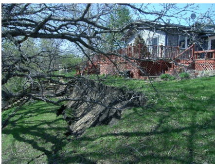
1. Areas with soils showing signs of erosion, especially on or near the top and bottom of steep slopes and bluffs.

The application form requires applicants to develop a restoration (or planting) plan. Developing the restoration plan is the most significant part of the application. Restoring vegetation in the same location as that removed may or may not be possible or desirable depending on the reason for removing the vegetation, and other priority areas or opportunities for restoration. The application asks applicants to assess their property to identify if any of the following three "restoration priority areas" exist: