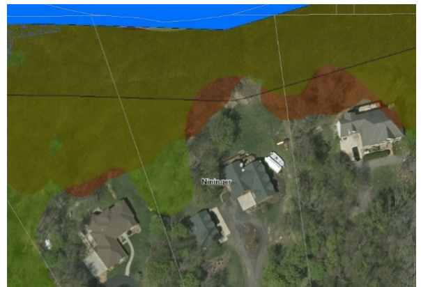
Example of aerial photo from DNR's online PCA mapper.

Note: Aerial photos printed from the DNR's online PCA mapper (see example to the right) show property boundaries and PCAs. The locations of the vegetation proposed to be cleared and restored can be shown on these aerial photos with hand drawings. Detailed site plans, including a survey, may be needed for more complex projects.