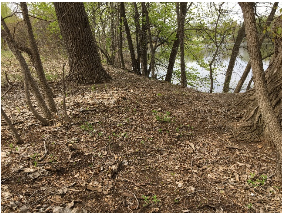
Selective vegetation removal is the removal of only isolated individual trees and shrubs that do not substantially reduce the tree canopy or understory.

The MRCCA is a corridor of land along each side of the Mississippi River in the Twin Cities Metro Area with coordinated state, regional and local land use planning and zoning. Vegetation removal is regulated through a local permit to protect the corridor's scenic, natural, and recreational features.