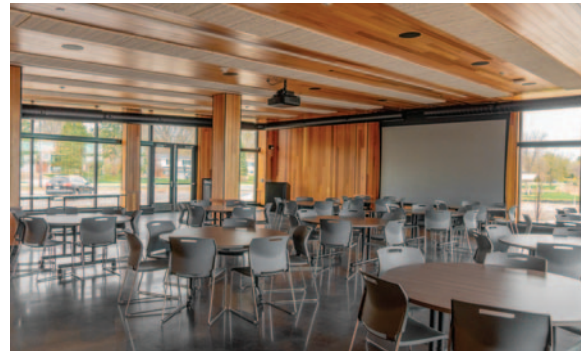
MOORE LAKE COMMUNITY BUILDING

Springbrook Nature Center offers four indoor classrooms and an amphitheater to rent between 10 a.m. and 4 p.m. on a daily basis. They are great venues for family gatherings, showers, birthday celebrations, business meetings, and more. Picnic shelter rentals are available on weekends from May 1 - October 1. Call 763-572-3588 to schedule your rental!