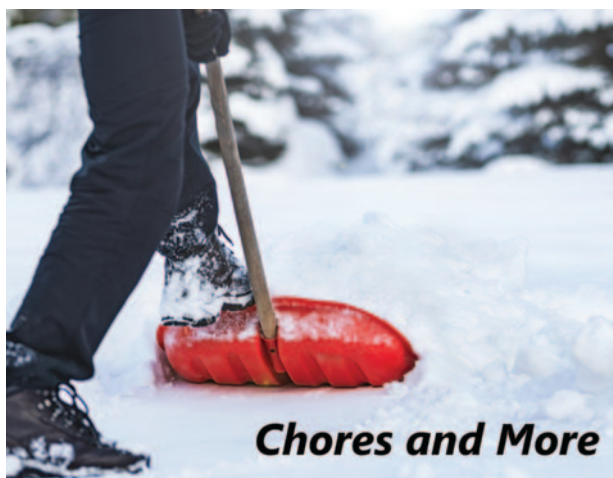
Chores and More

Upon request, accommodation will be provided to allow individuals with disabilities to participate in any City of Fridley services, programs, or activities. Hearing impaired persons who need an interpreter or other persons who require auxiliary aids should contact the City at 763-572-3450.