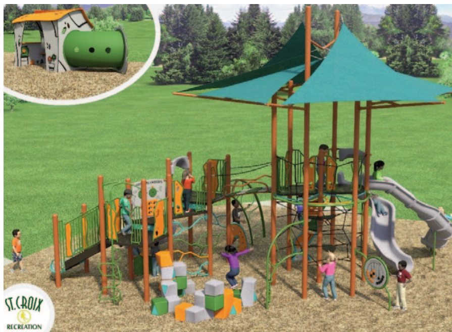
ONE OF THREE PLAYGROUND CONCEPT PLANS CREATED FOR A NEIGHBORHOOD PARK IN FRIDLEY

Commons Park, centrally located in Fridley, will also be redeveloped over the coming years with the addition of a pickleball court complex, splash pad, community building and destination inclusive playground.