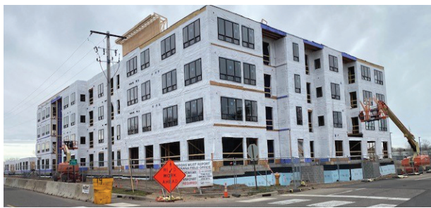
Market Rate Apartments at Train Station Village