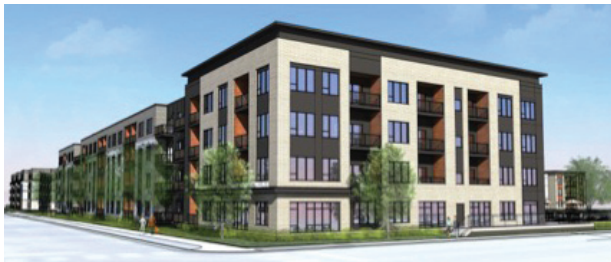
Kaas Wilson Architects - Market Rate Building