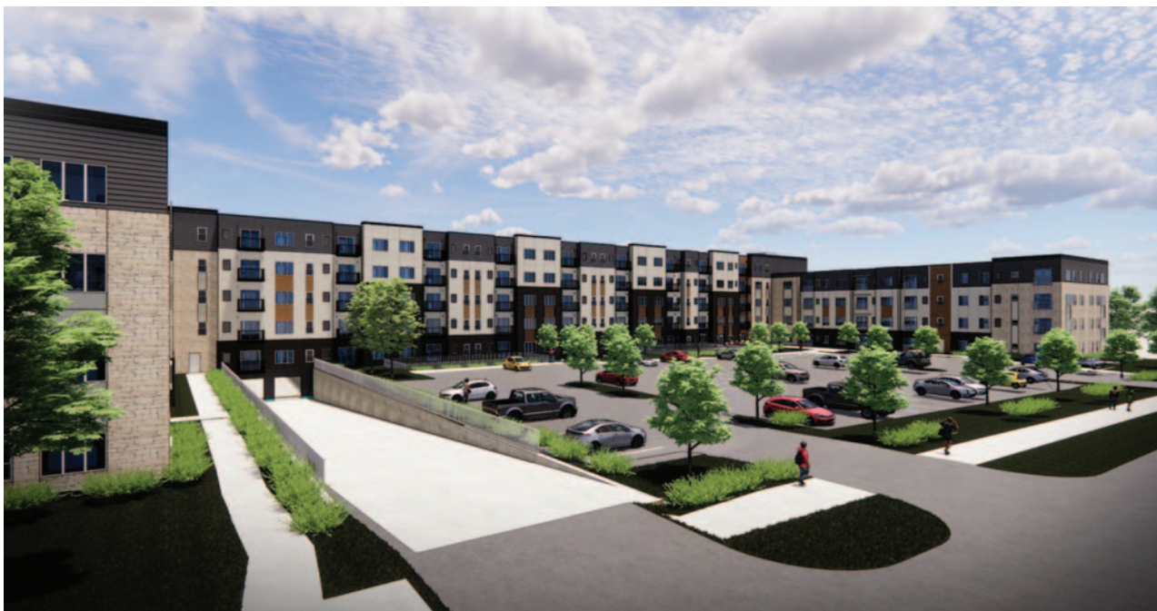
ILLUSTRATION CREDIT: KAAS WILSON ARCHITECTS

Construction of this complex is anticipated to begin fall 2023.